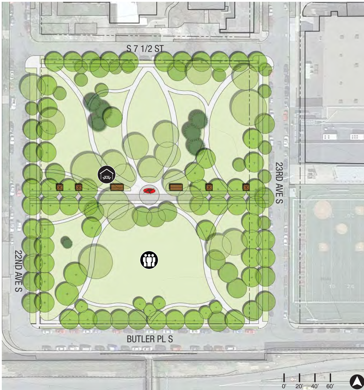
Proposed Plan: Murphy Square