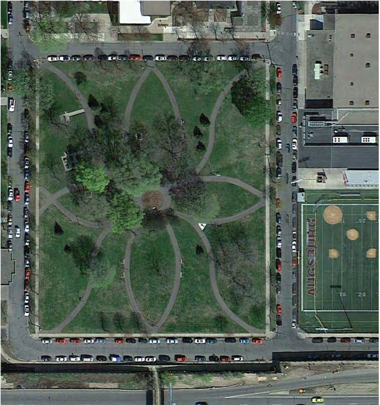
Existing Conditions: Murphy Square