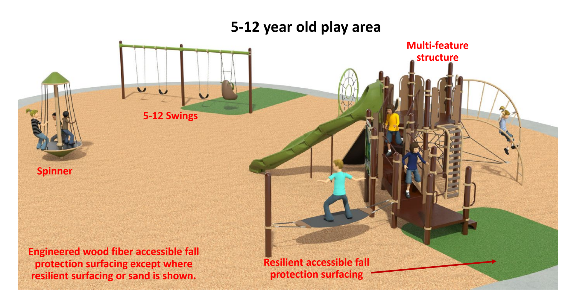
Rendering of Concept Plan