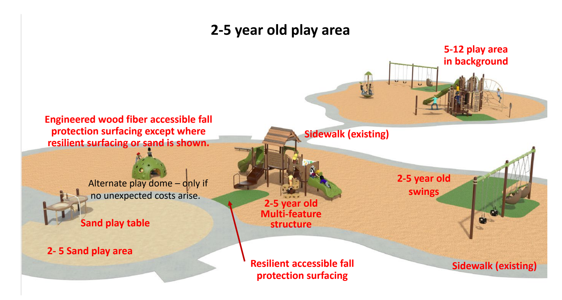
Rendering of Concept Plan