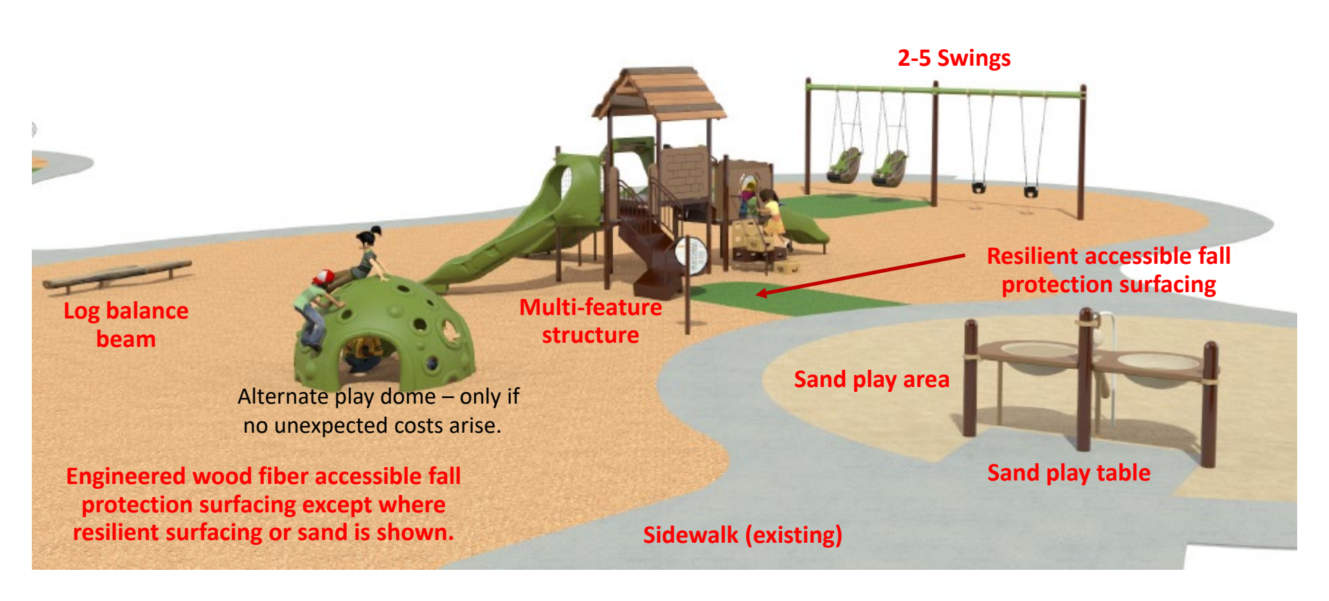
Rendering of Concept Plan