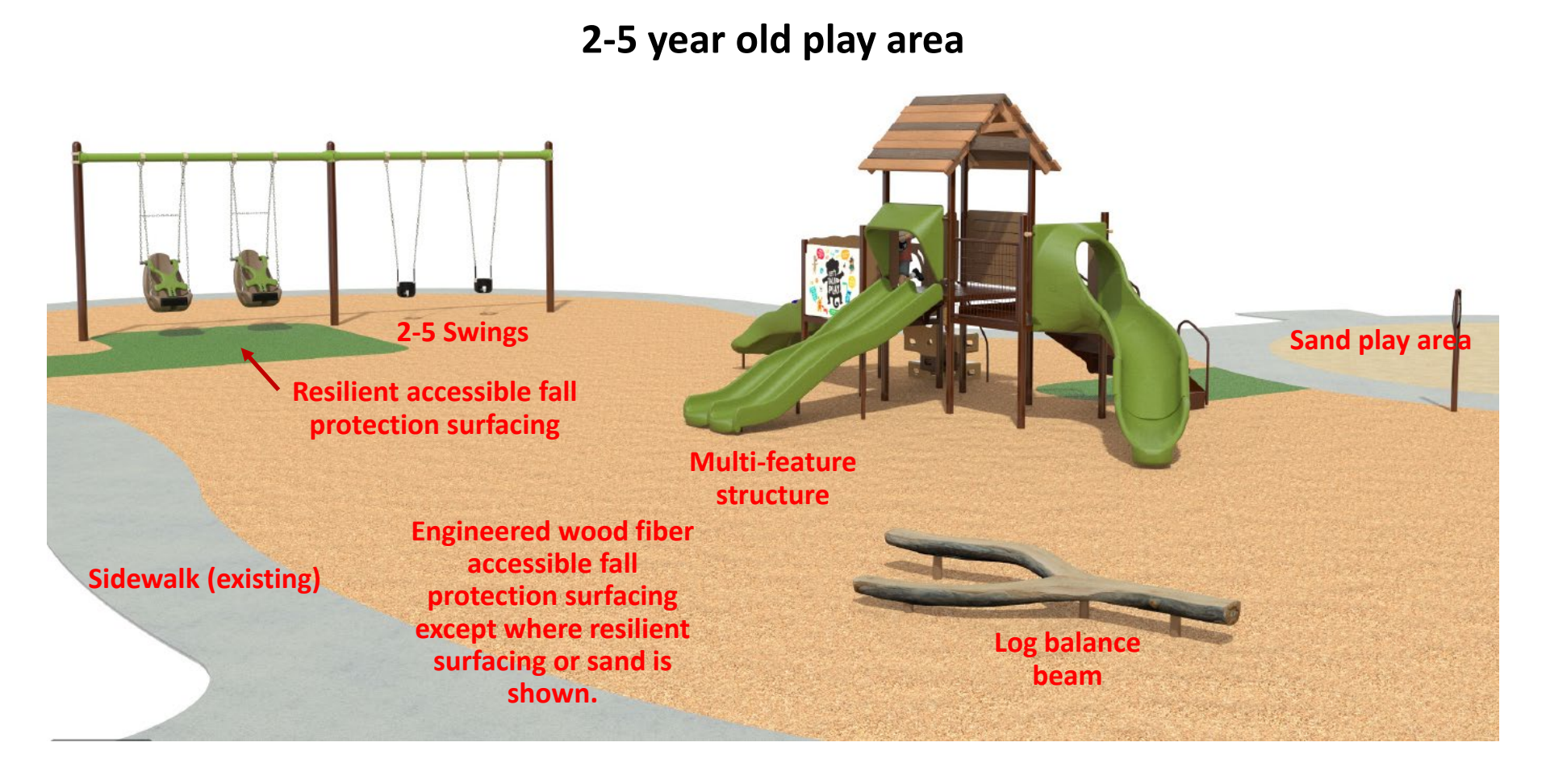
Rendering of Concept Plan