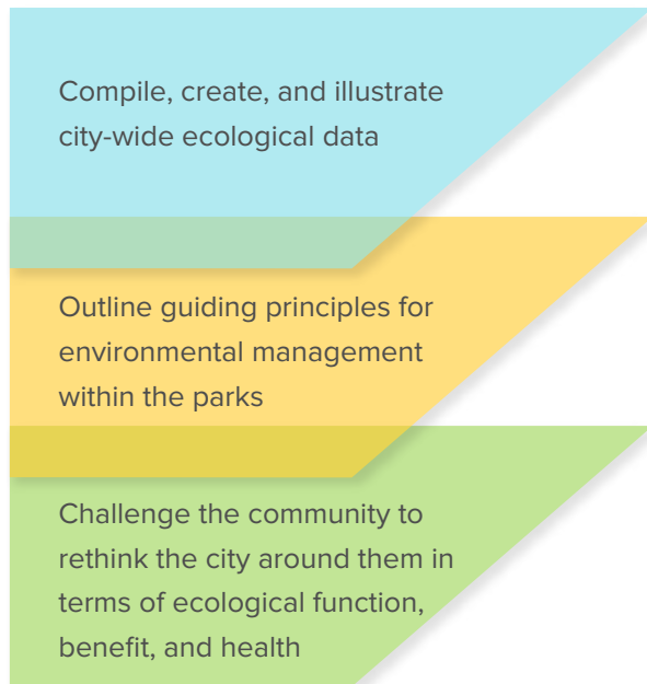
Figure 1. Ecological System Plan.

To successfully achieve the goals set forth in its vision, MPRB has recognized the need to partner with other agencies and organizations to achieve long term sustainability with its planning efforts. In partnership with the Mississippi Watershed Management Organization, MPRB has developed this Ecological System Plan to: