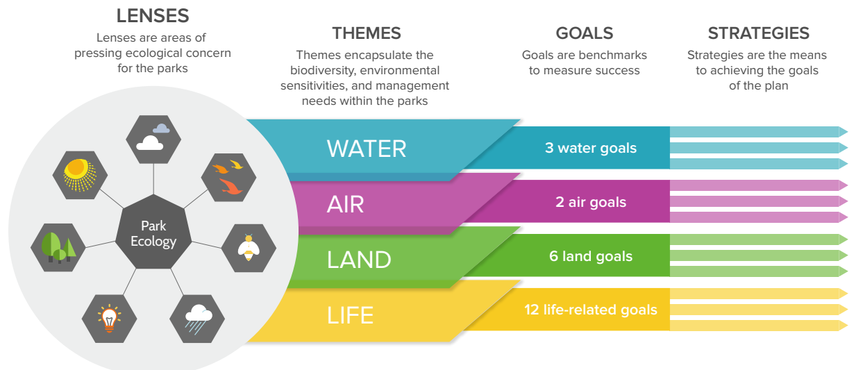
Figure 3. Ecological System Plan Approach

what can be done both on the individual park and system level to address environmental challenges that exist well beyond park boundary lines. As such, goals and strategies will be presented to address how these particular areas of concern within the park system relate back to the broader plan themes.