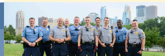
Park Police Officers and Patrol Agents work closely together