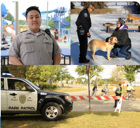
Park Agents promote park safety and enforce ordinances