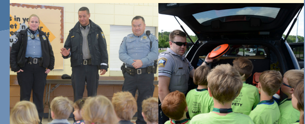
Park Agents assist with event and community outreach

Minneapolis Park Police Department Attention: Recruiting Officer parkpolice@minneapolisparke.org 612-230-6550