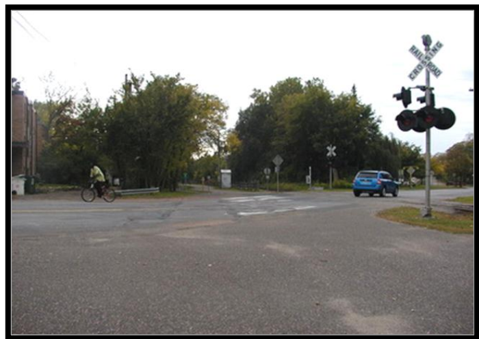
4 Looking north along the corridor and across Cedar Lake Parkway-Grand Rounds; Cedar Lake at left