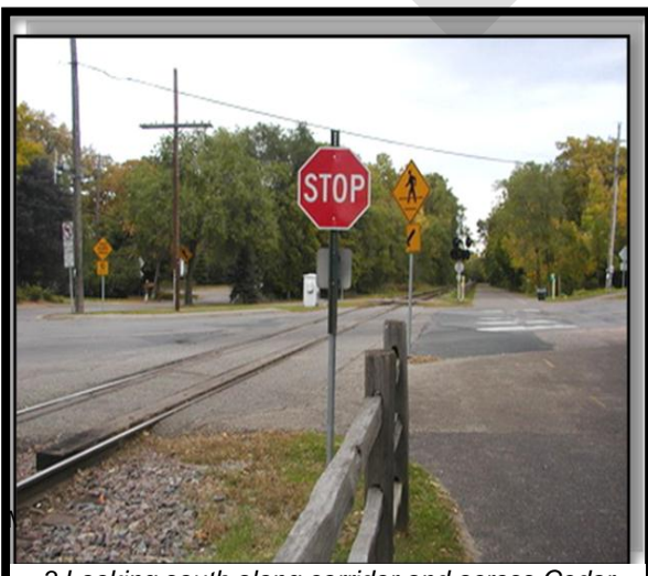
3 Looking south along corridor and across Cedar Lake Parkway-Grand Rounds; Cedar Lake at right