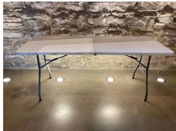
One, 6 ft. white plastic folding table