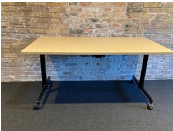
Six, 5 ft. rectangular tables