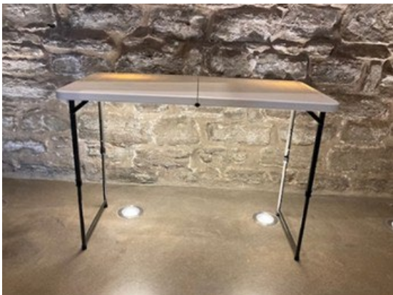
One, 4 ft. white plastic folding table adjustable height to 34"