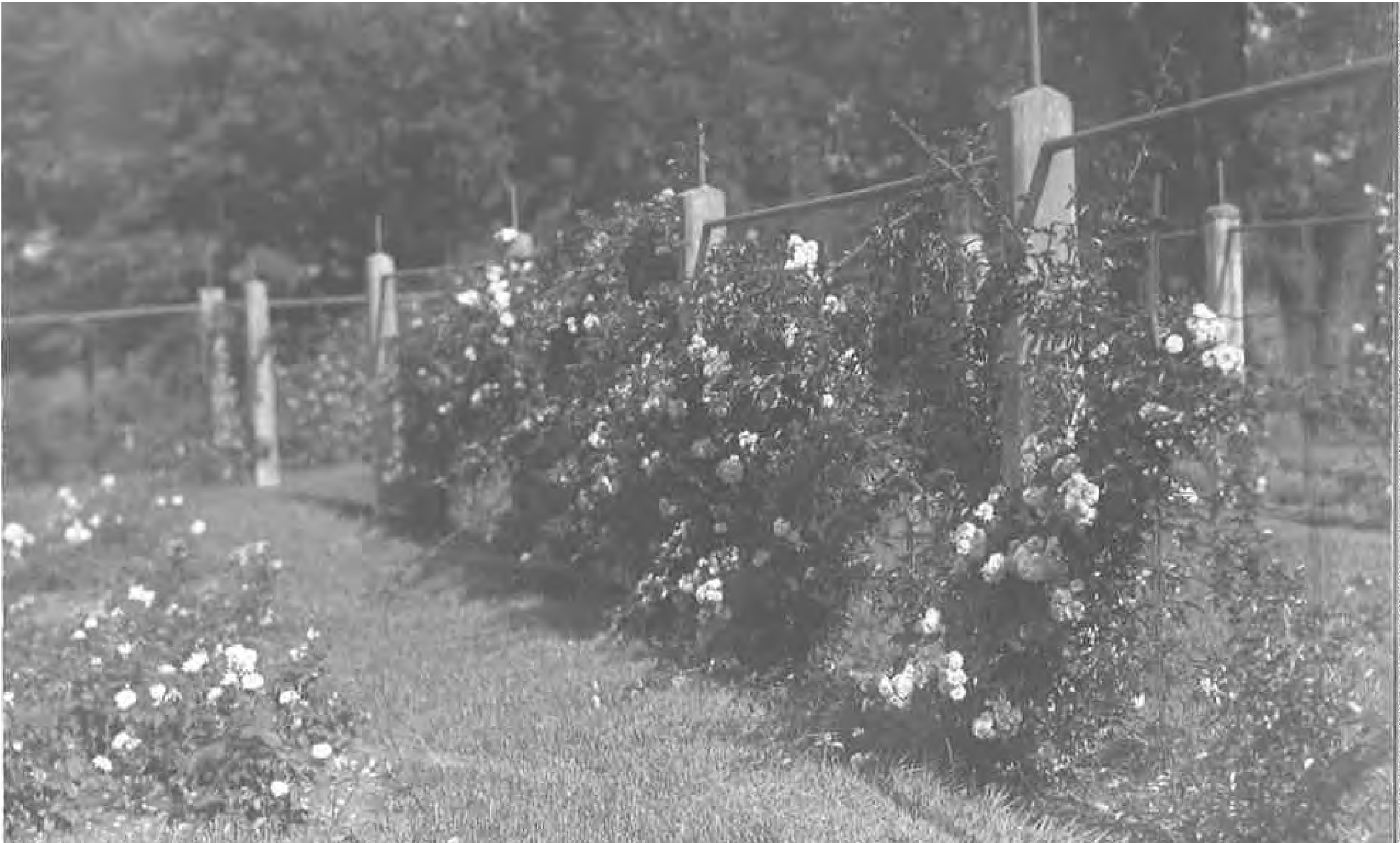
LYNDALE PARK ROSE GARDEN PRECEDENT STUDY