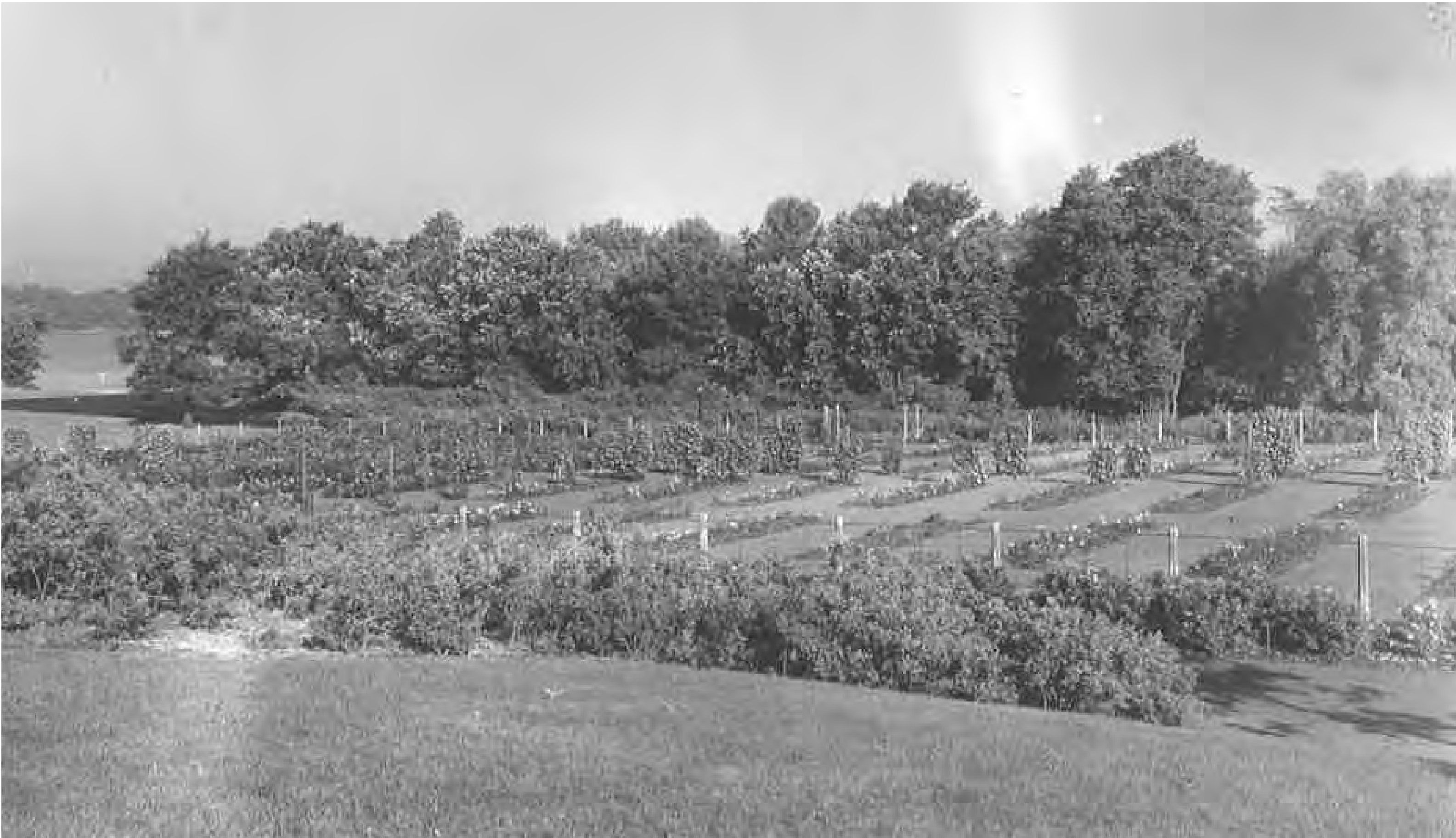
LYNDALE PARK ROSE GARDEN PRECEDENT STUDY