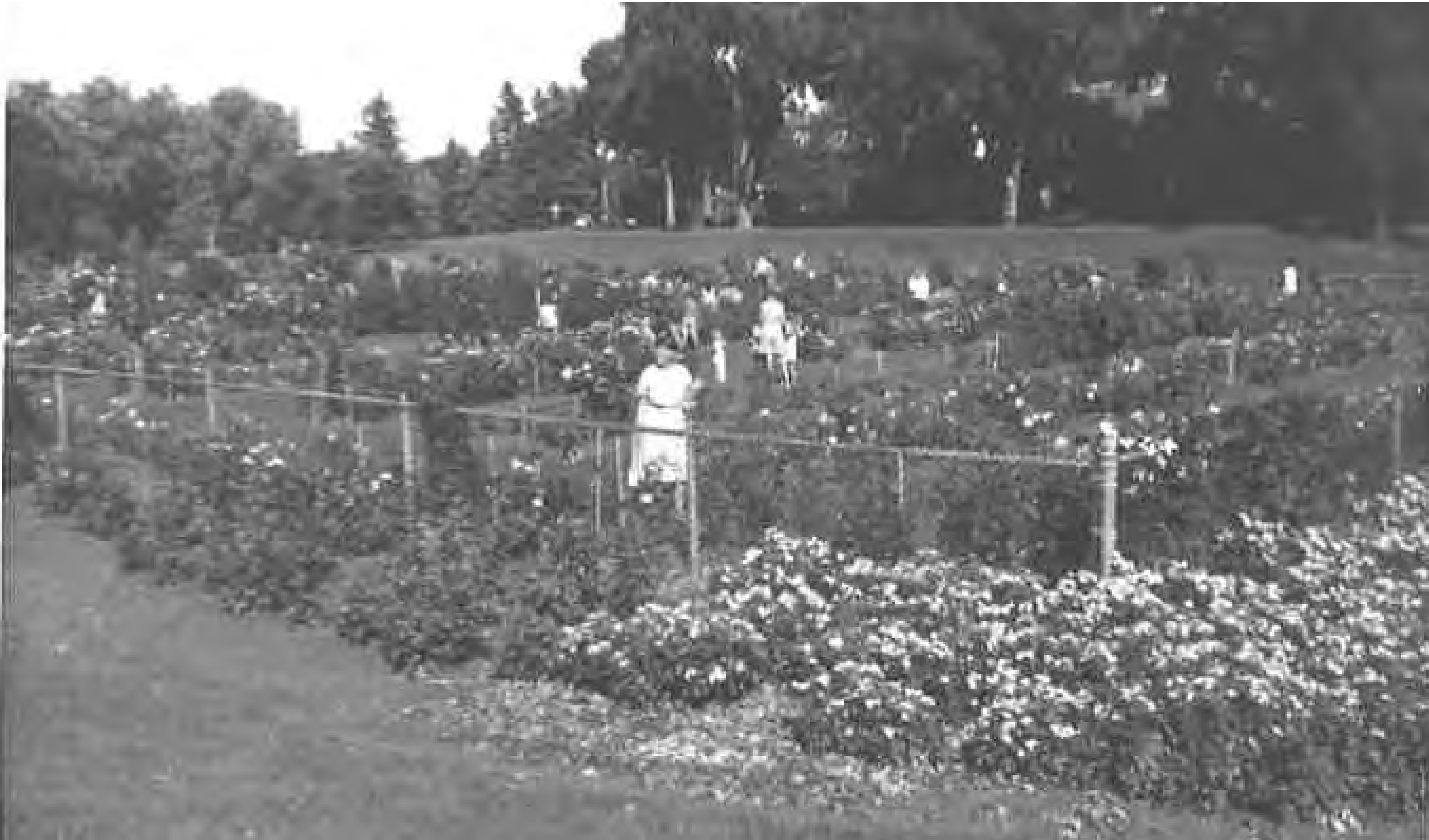
LYNDALE PARK ROSE GARDEN PRECEDENT STUDY