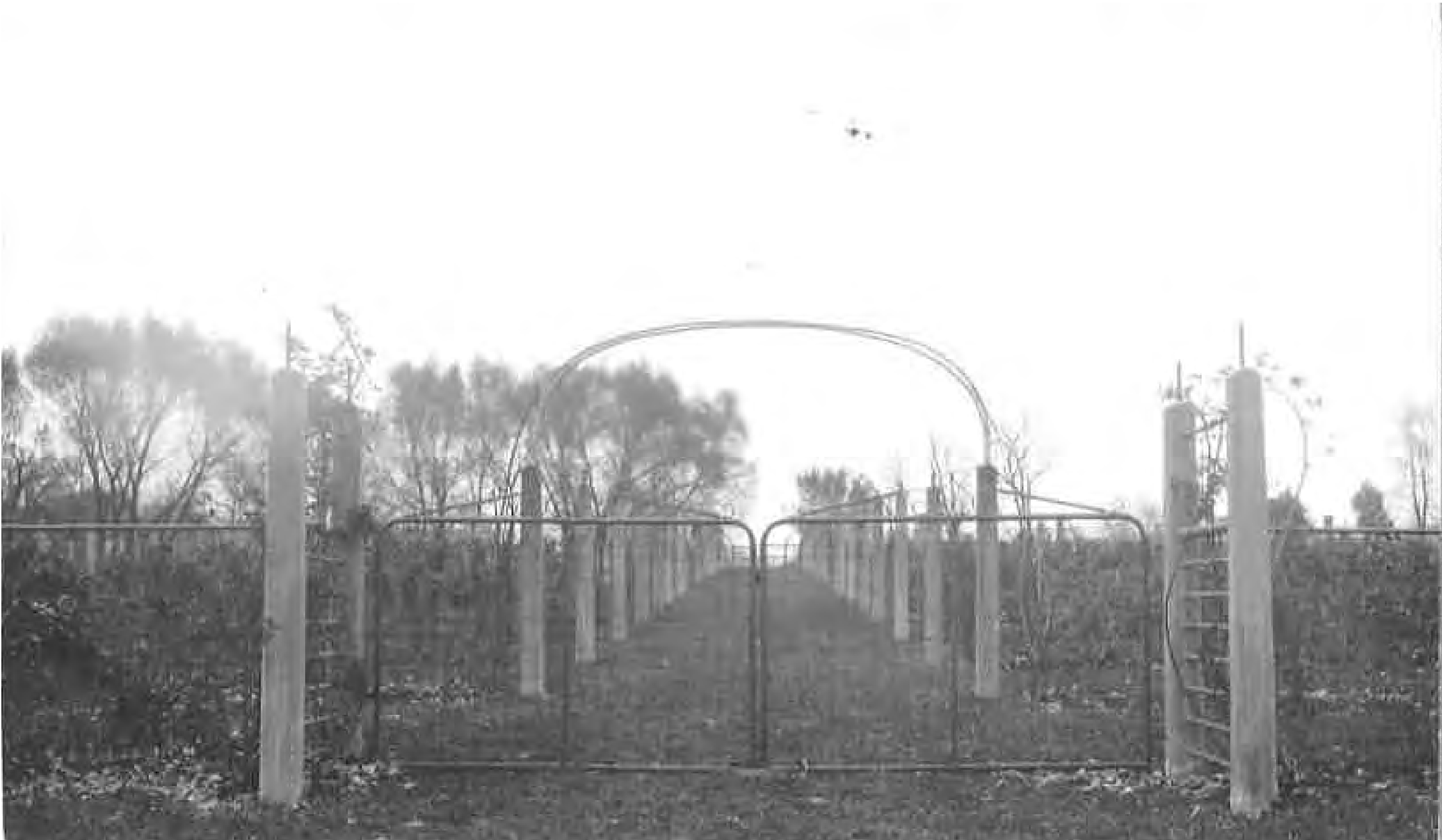
LYNDALE PARK ROSE GARDEN PRECEDENT STUDY