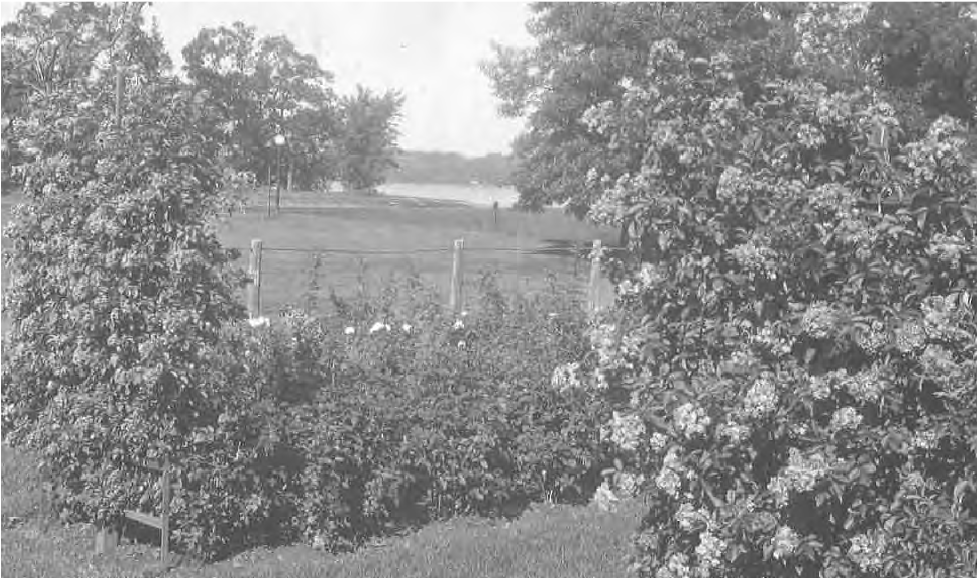
LYNDALE PARK ROSE GARDEN PRECEDENT STUDY