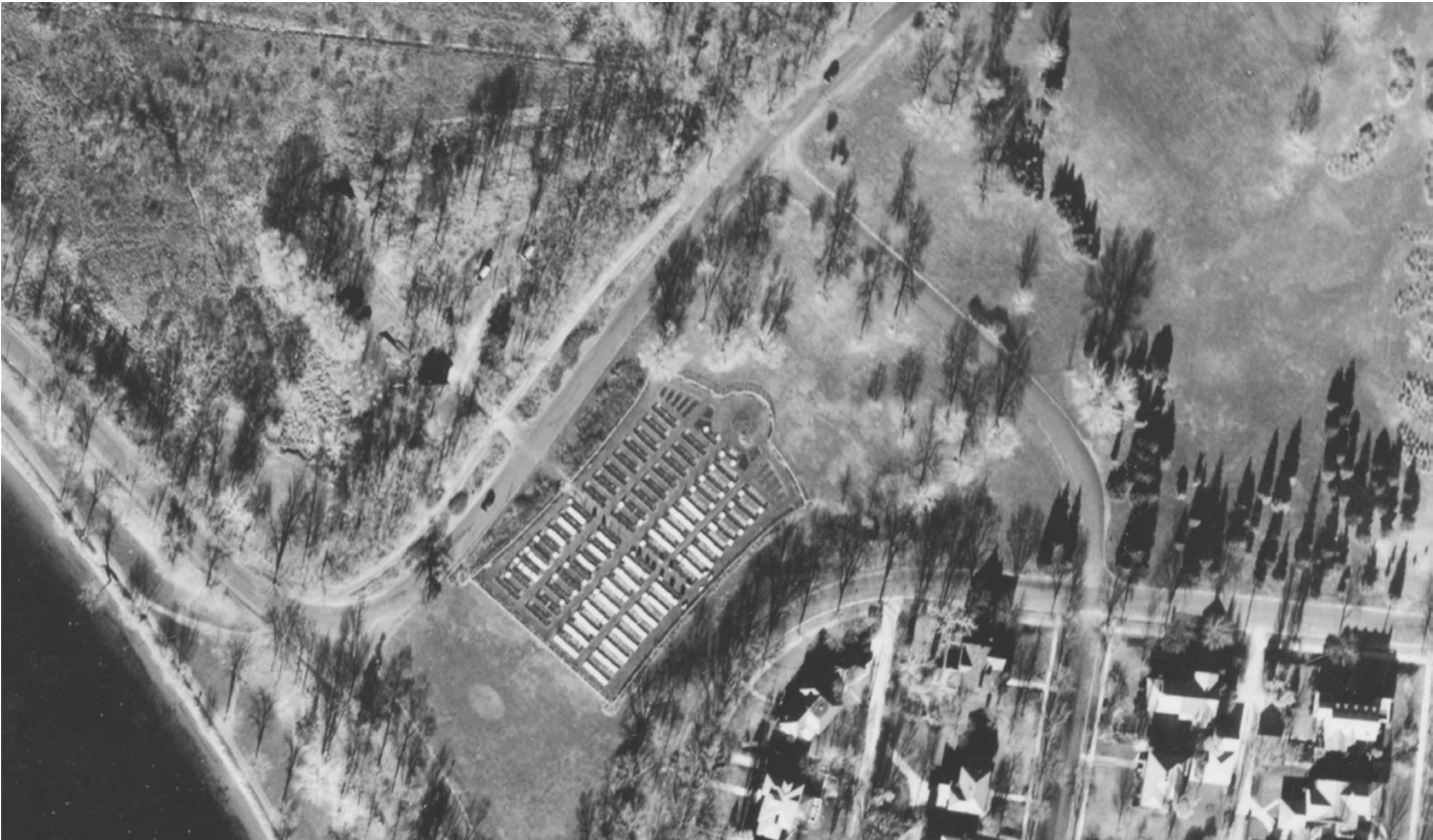
LYNDALE PARK ROSE GARDEN PRECEDENT STUDY