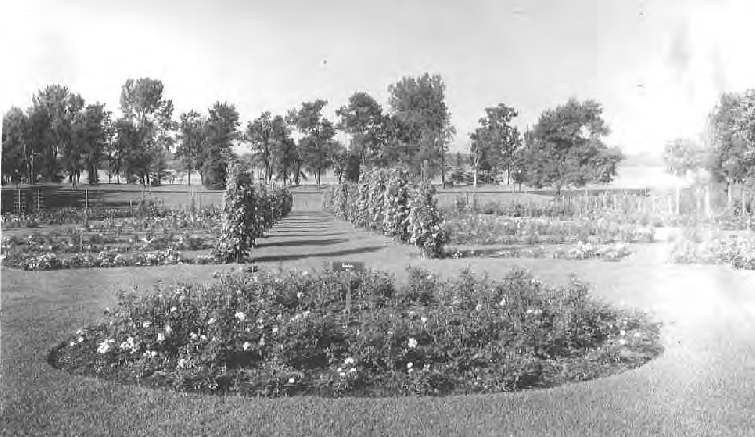
LYNDALE PARK ROSE GARDEN PRECEDENT STUDY