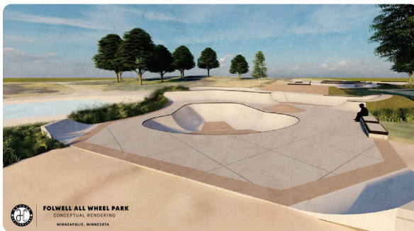
Perspective view of the bowl, featuring the quarter pipe and pump bump, with the rest of the all-wheel park beyond.