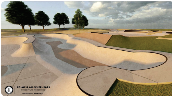
Perspective view of the snake run from the northeast.