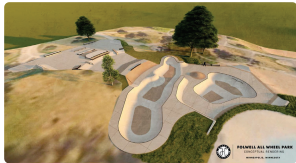
Perspective view from above, showing snake run and bowls from the southeast.