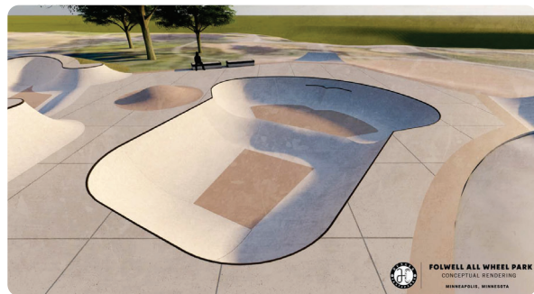
Perspective of the bowl, featuring the pump bump and quarter pipes.