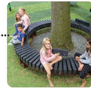
PICNIC TABLES UNDER TREES SHADE

OTHER SITE IMPROVEMENTS INCLUDE THE ADDITION OF PEDESTRIAN LIGHTS, PICNIC TABLES, BENCHES, BIKE RACKS, STORMWATER MANAGEMENT AND WALKING PATHS.