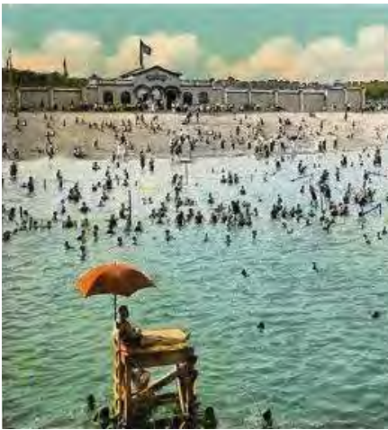
Lake Nokomis Beach post card