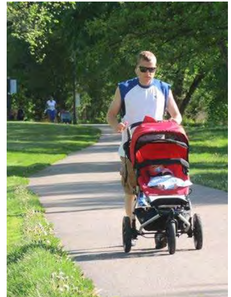
Families enjoy the trails for exercise