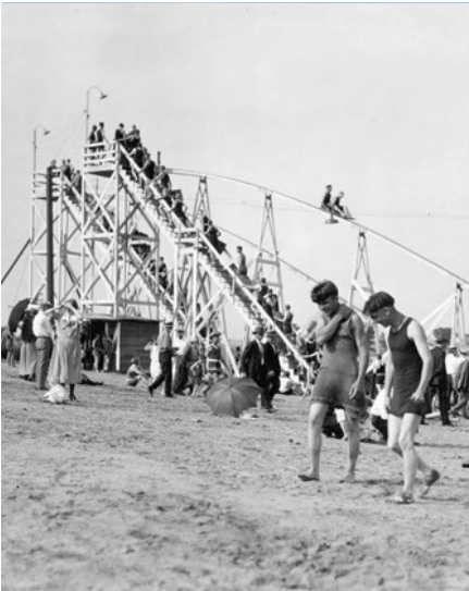
Water toboggan at Lake Nokomis