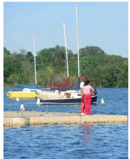
Lake Nokomis is one of three sailing lakes in Minneapolis