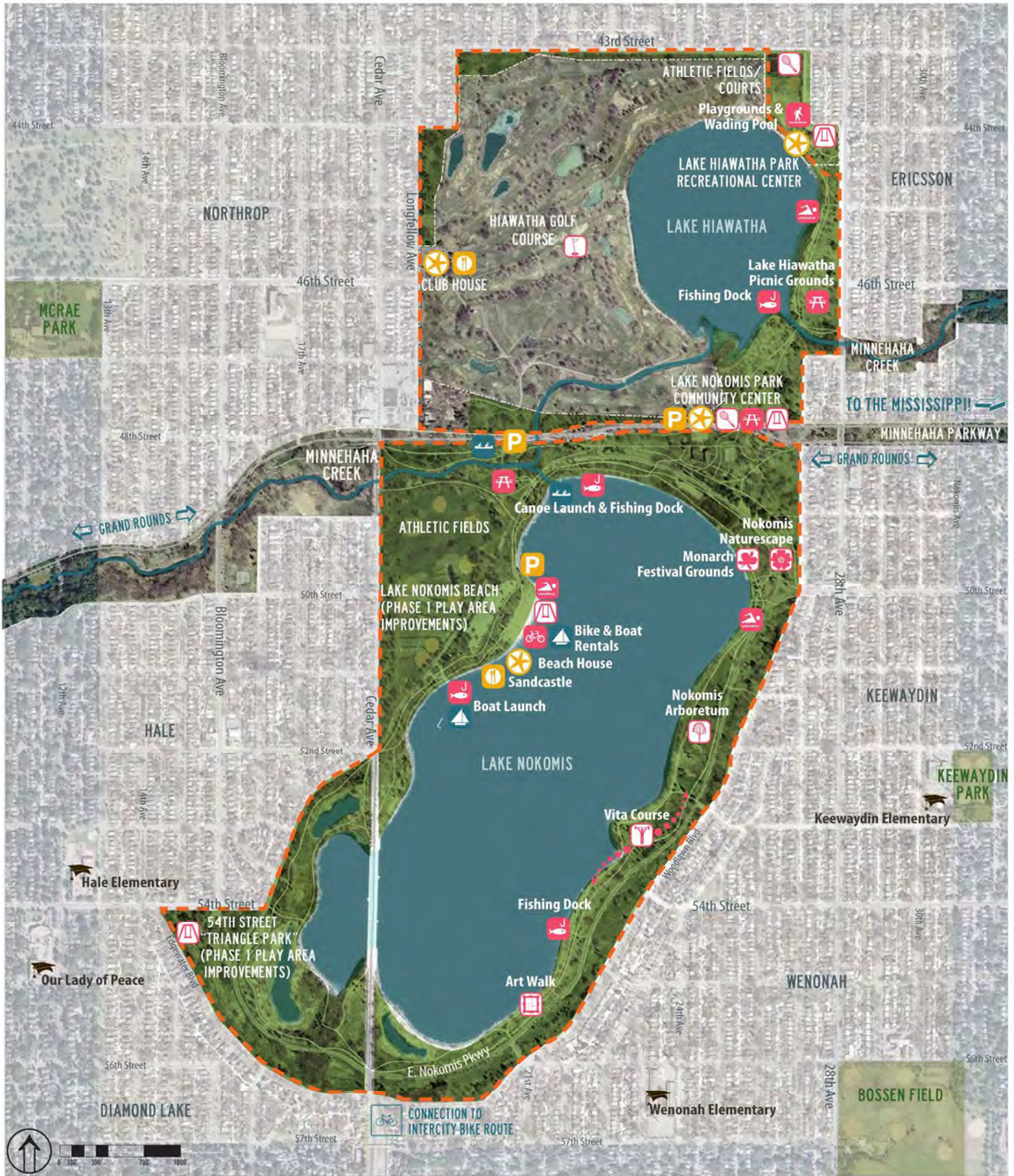
Nokomis-Hiawatha Regional Park Existing Conditions