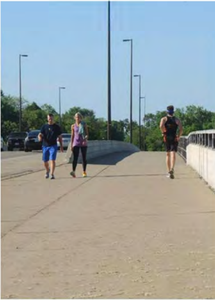
Pedestrians crossing Lake Nokomis on the Cedar Avenue bridge