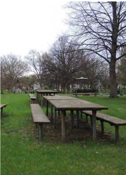
WPA picnic tables and benches remain

Work began in 1914 to dredge Lake Nokomis and build up the surrounding land. Dredges worked for four years to realize Wirth's vision, moving a total of 2.5 million cubic yards of earth. The fill was allowed to settle for five years before further grading and planting completed the park's transformation. A new bath house was built at the beach on the west shore. Upon its opening in 1920, Lake Nokomis immediately surpassed Lake Calhoun as the most popular beach destination in Minneapolis.