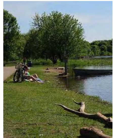
Passive recreation at Lake Hiawatha