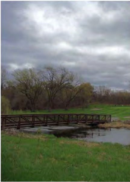
A flooded Minnehaha Creek