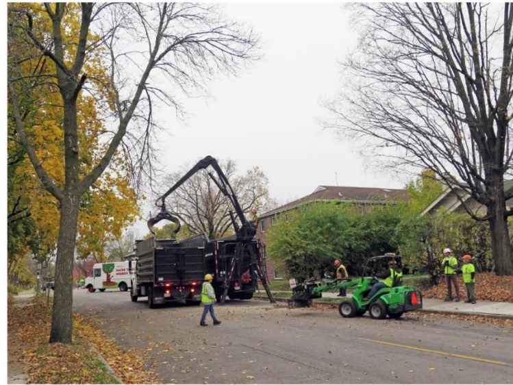
A crew from the Minneapolis Park Board removes ash tree branches along Grand Avenue in 2016. The crew removed ash trees as part of a plan to harvest boulevard ash trees as emerald ash borer spreads and replant with more diverse species.