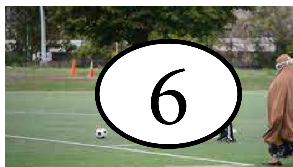
Improved Use Field

Note: other improvements ranked higher for item, 7 and 8, however these items were already selected as higher priority first.