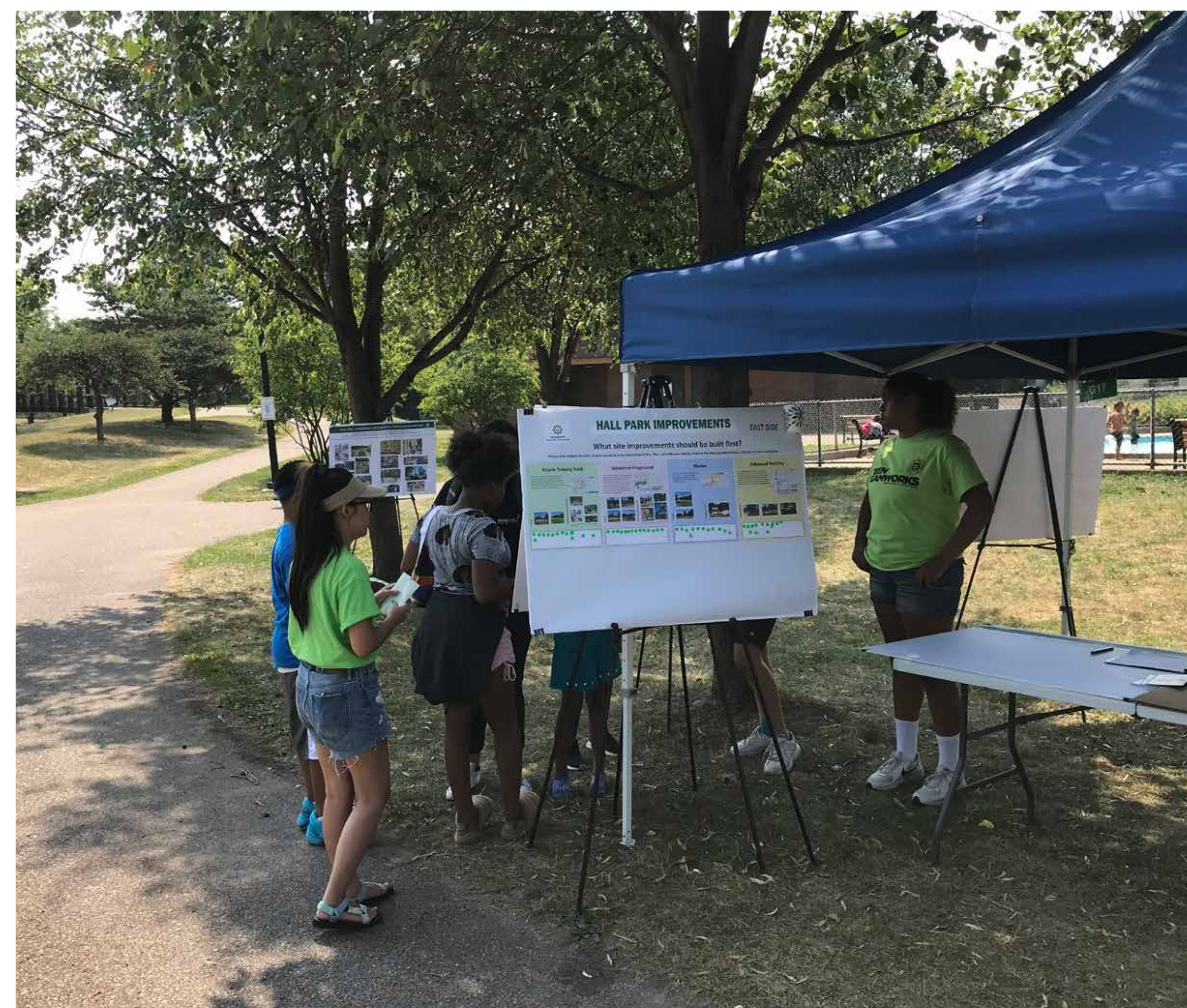
Bottom left. Model of park built by MPRB Youth Design Team who helped with community engagement for two weeks in the summer 2021. Bottom right is a community engagement open house at the park in the summer 2021.