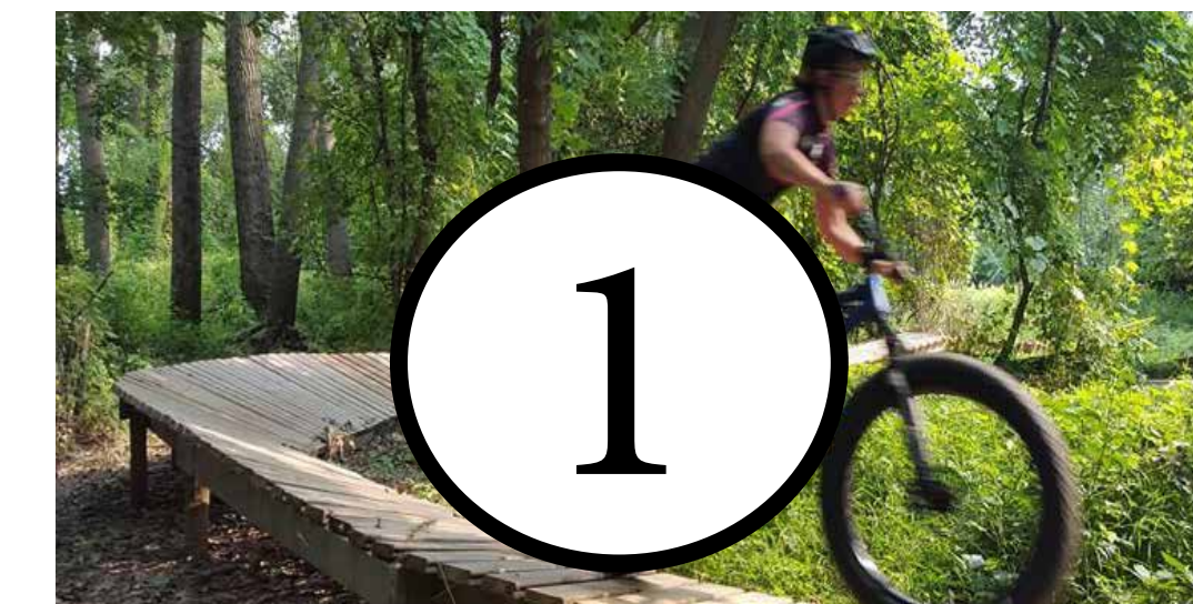
Bicycle Training Track