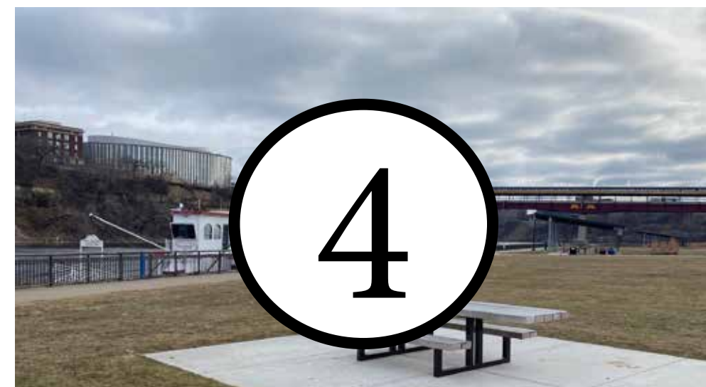
Improved Picnic Area