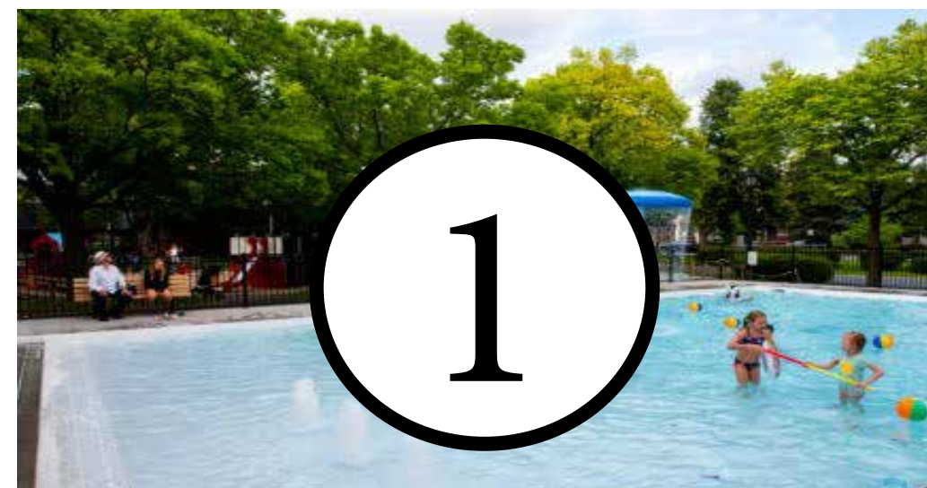
Improved Wading Pools