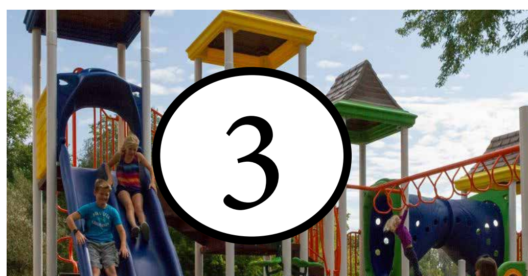
Enhance & Improved Playground