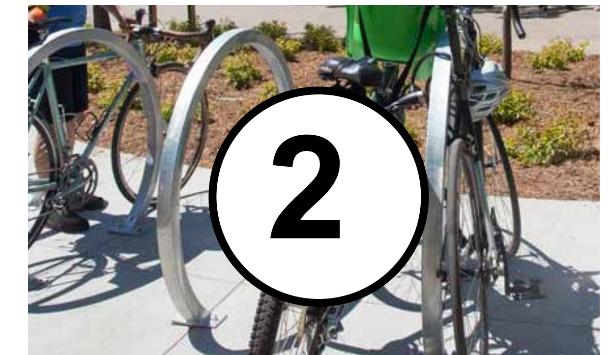
New Site Amenities