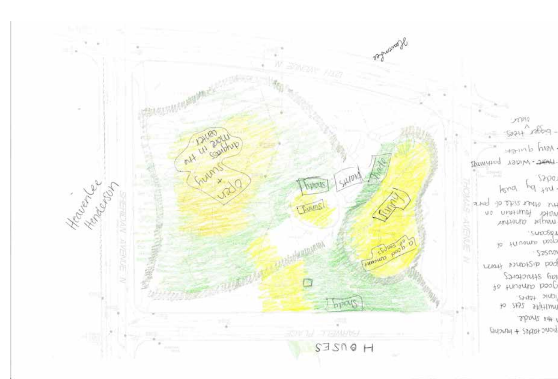
Above Left. Community attending open house at park. Above Right. Drawing by Youth Design Team member showing observations of potential park improvements at Farwell.