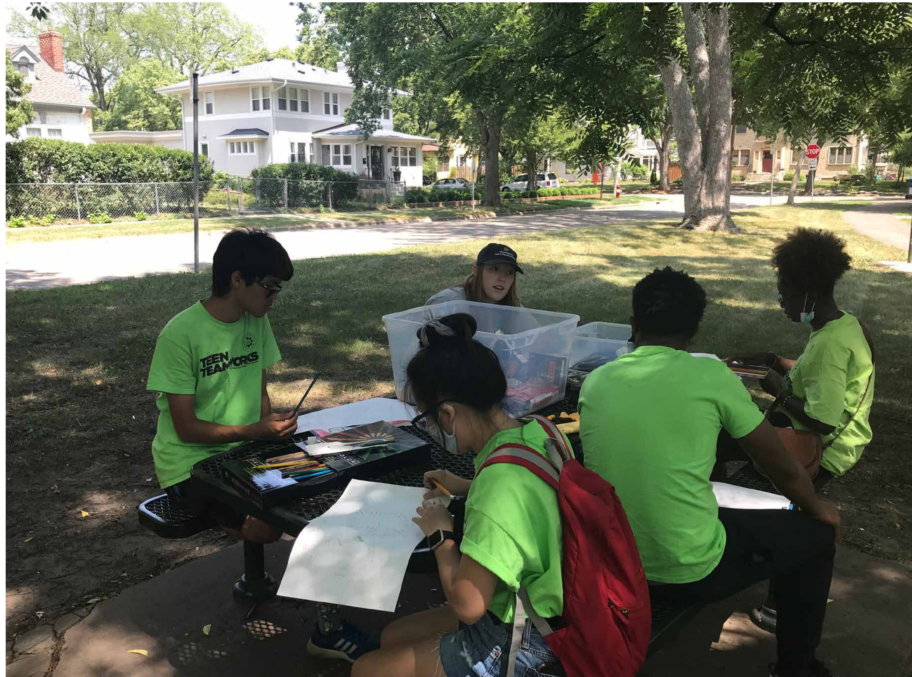
Above. The MPRB Youth Design Team consisting of Minneapolis youth helped with engagement for the project for several weeks during the summer of 2021. Right. Community engagement event during summer 2021.