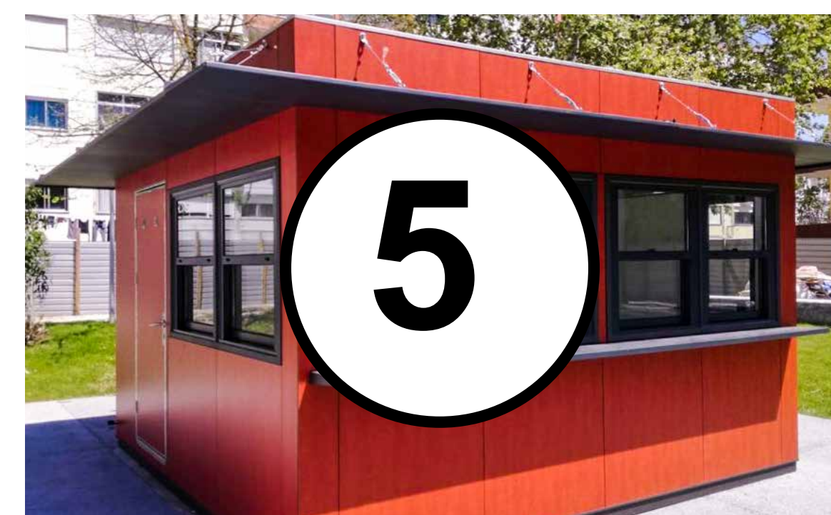
New Park Building/ Kiosk