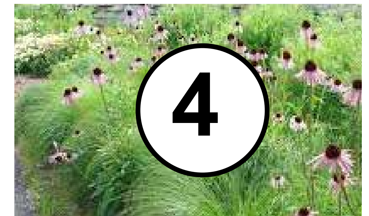
New Natural Areas