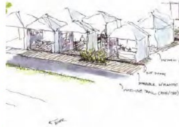
Charrette Concept for Flexible Street Section for Festivals/Market tents