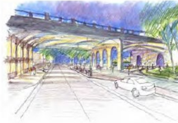
Charrette Concept for 3rd Avenue Bridge Performance Space