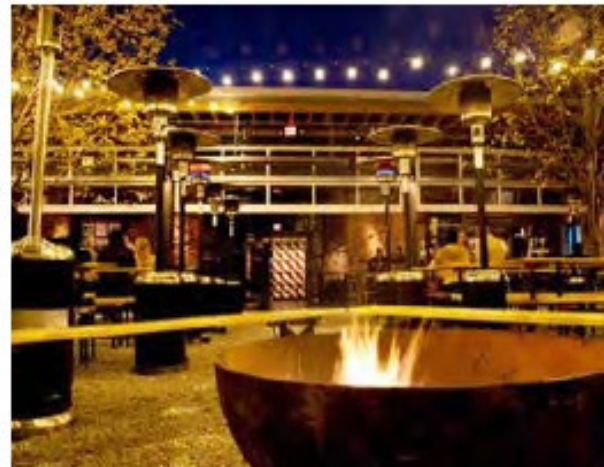
Outdoor Seasonal Dining