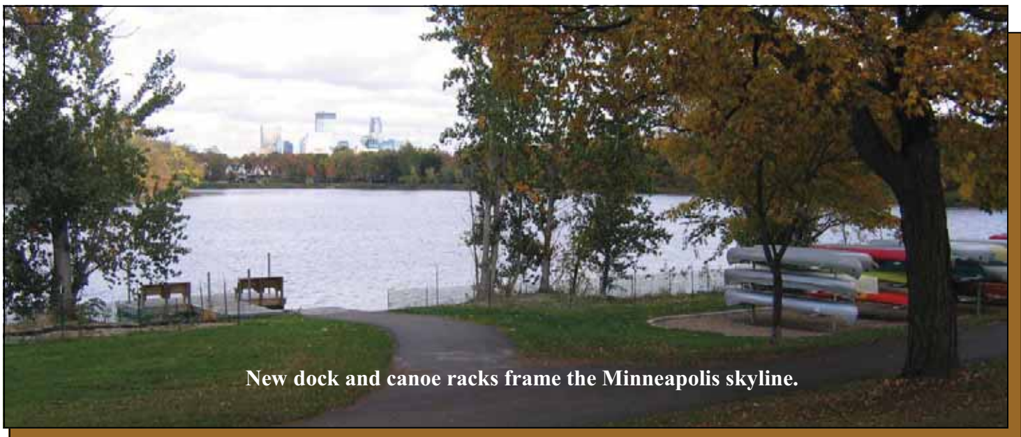
New dock and canoe racks frame the Minneapolis skyline.