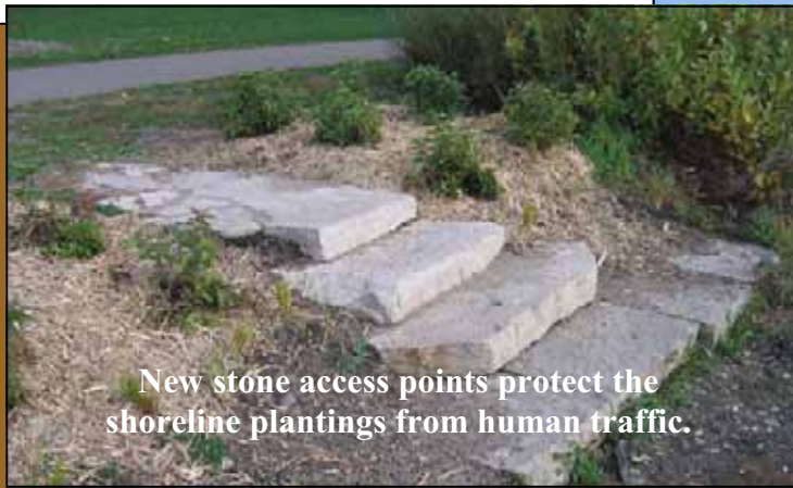
New stone access points protect the shoreline plantings from human traffic.