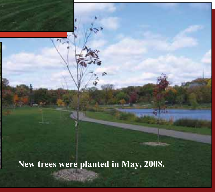
New trees were planted in May, 2008.