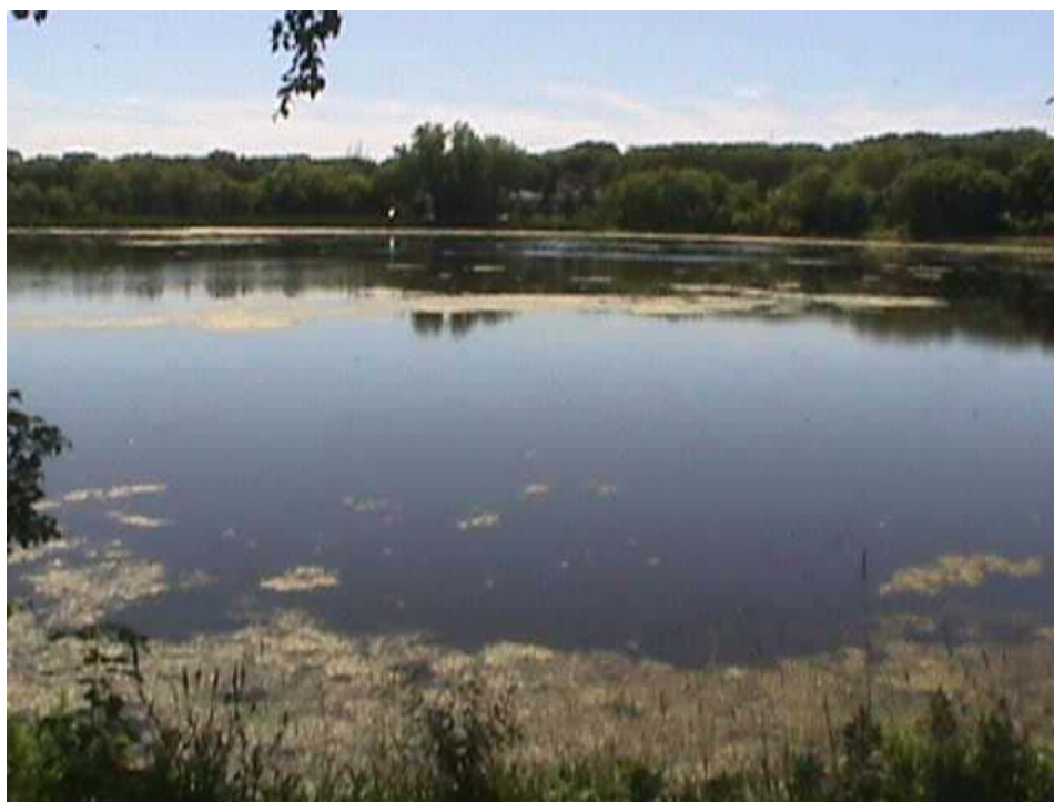
Figure 7A. Photograph of Grass Lake in 2005.

Grass Lake was originally part of Richfield Lake (to the south) and more than double its current size, but the two were separated during the construction of State Highway 62. It is a Type 5 wetland (Figure 7A). Grass Lake is a neighborhood lake, in southern Minneapolis, known for good bird watching. The lake is not connected to the Minneapolis Park system. The morphometric data can be seen in Table 7A. Grass Lake was added to the Minneapolis Park & Recreation Board (MPRB) lake sampling program in 2002.